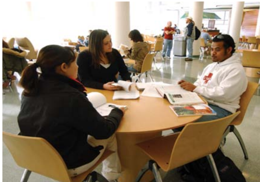
For many students, the library is the best place on campus to study

In addition to providing a great, reliable place to study during finals week, the libraries also holds fun, relaxing activities. To help alleviate student stress, faculty at Meyer Library held activities such as late night coffee breaks, free snacks, massage chairs, and therapy pets -- a big hit among students. Outreach for these activities was done through social media and had an average of 135 responses on Facebook and reached 1,322 people on Twitter. Beginning in December 2014, the 24 Hours of finals week will expand to six consecutive nights.