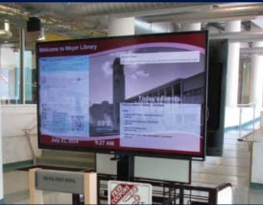
The "Jumbotron" can be found in the front lobby of Meyer Library

Nicknamed the Jumbotron by staff, the large video display at the front entrance of Meyer Library is a collaborative project with the Provost, the Graduate College, and the Libraries. The primary purpose of the display is to inform library patrons of programs and services provided by the partners and to make patrons aware of campus energy usage. Displayed content includes the current day's events in the library, energy dashboard, information on graduate school programs, information on services and programs in the library, content from the library digital collection, news events, social media streams, and, everyone's favorite: the current outdoor temperature.