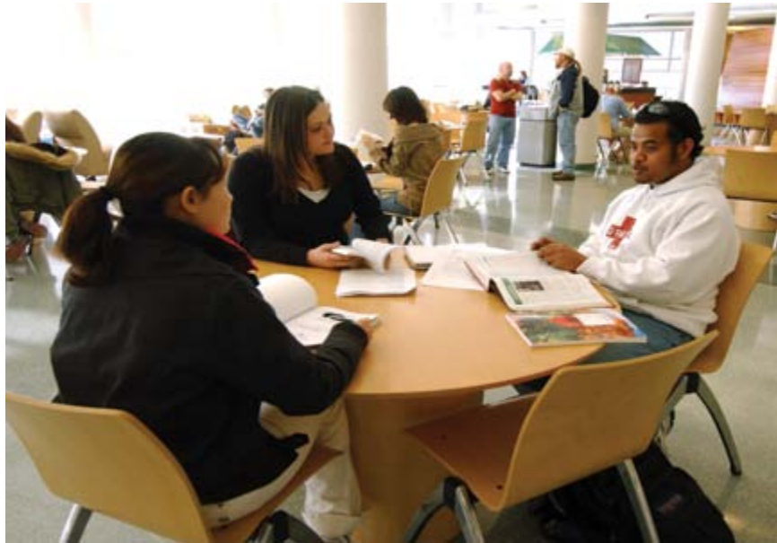
For many students, the library is the best place on campus to study

In response to a request by the Student Government Association, the University Libraries keeps Meyer Library open for 24 hours per day during finals week. Since 2013 we have extended our hours for finals week in order to meet the needs of students.