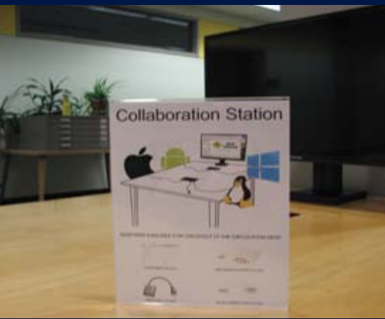
One of the six collaboration stations at Meyer Library

Many students will find new opportunities to do group work at the library. Earlier in February of 2013, a collaboration station was installed on the first level of Meyer Library. The station can aid students in group collaboration by providing multiple ports for various portable computers.