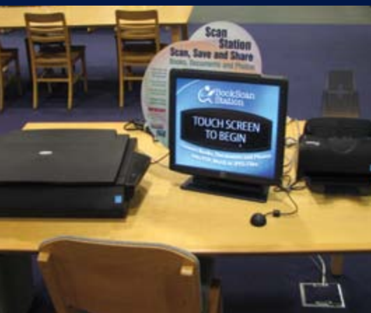
One of three scanning stations located in Meyer Library

In fall of 2013, Meyer Library began implementing free, self-service, simple scanning stations. The stations allow students to scan parts of books or documents and save them onto a flash drive or their Google Drive. The process is user-friendly and employs a touch screen that displays the different options available and instructs the user on how to make the scan. Funding for the stations was provided by the Provost and a SCUF grant. Currently, three scanning stations are located on the lower, first, and second levels.