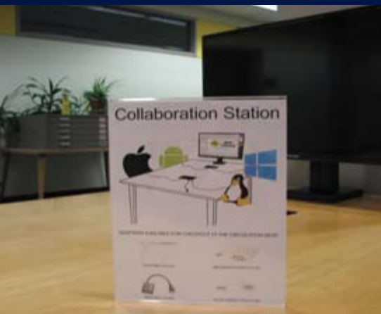
One of the six collaboration stations at Meyer Library

Many students will find new opportunities to do group work at the library. Earlier in February of 2013, a collaboration station was installed on the first level of Meyer Library. The station can aid students in group collaboration by providing multiple ports for various portable computers.