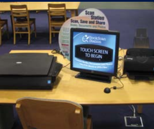
One of three scanning stations located in Meyer Library

In fall of 2013, Meyer Library began implementing free, self-service, simple scanning stations. The stations allow students to scan parts of books or documents and save them onto a flash drive or their Google Drive. The process is user-friendly and employs a touch screen that displays the different options available and instructs the user on how to make the scan. Funding for the stations was provided by the Provost and a SCUF grant. Currently, three scanning stations are located on the lower, first, and second levels.