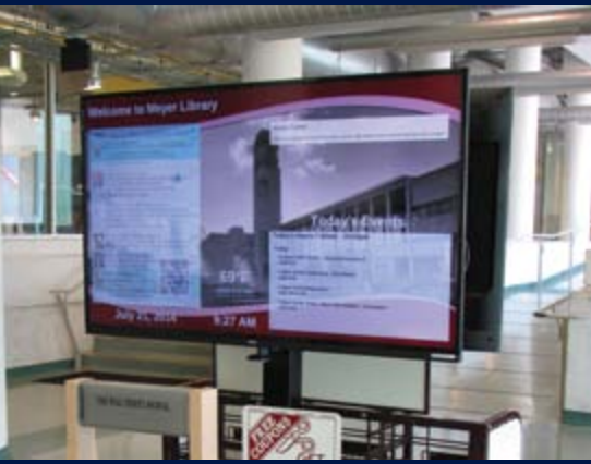
The "Jumbotron" can be found in the front lobby of Meyer Library

Nicknamed the Jumbotron by staff, the large video display at the front entrance of Meyer Library is a collaborative project with the Provost, the Graduate College, and the Libraries. The primary purpose of the display is to inform library patrons of programs and services provided by the partners and to make patrons aware of campus energy usage. Displayed content includes the current day's events in the library, energy dashboard, information on graduate school programs, information on services and programs in the library, content from the library digital collection, news events, social media streams, and, everyone's favorite: the current outdoor temperature.