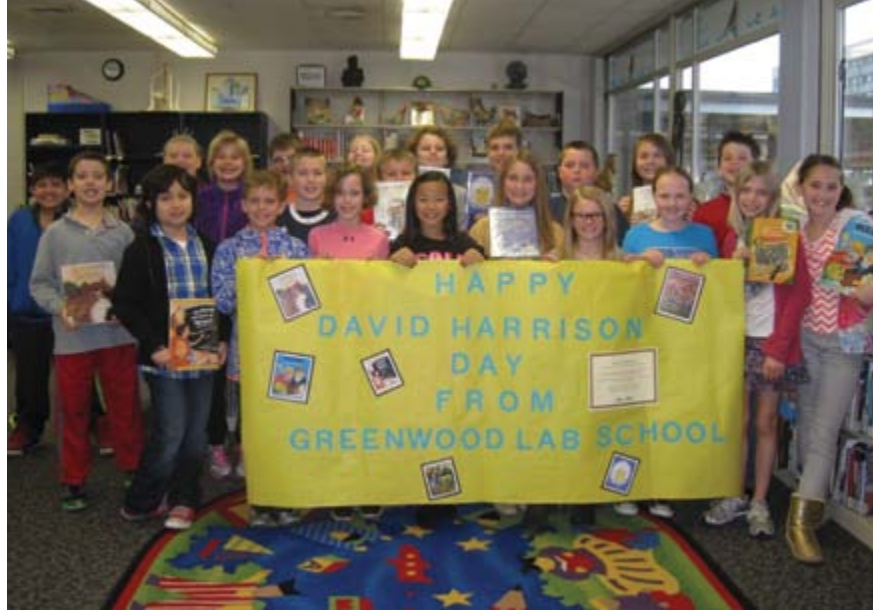
Greenwood students gathered at Haseltine Library to celebrate David Harrison Day